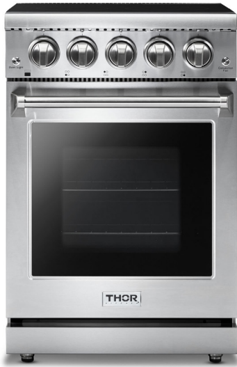
Product: 24 Inch Professional Electric Range in Stainless Steel Model Number: HRE2401